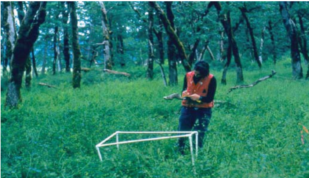
Biologist Carrina Maslovat conducts a vegetation survey using standardized methodology.

In this approach, all ecosystem components on the site, including species and key processes, are evaluated for their significance to the project's objectives. In most restoration projects, only a subset of components (such as the abundance of one or two species) is measured. Nevertheless, it is important to evaluate all major components at the outset in order to select the elements that warrant measurement and ensure that the selected subset of components is representative. In an ecosystem-based approach, sites adjacent to the project are also examined. This approach encourages restoration practitioners to look at several spatial scales, including the landscape in which a restoration project is situated.