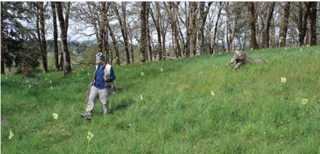
Biologist Tracy Fleming conducts a vegetation survey at Somenos Garry Oak Protected Area. Use of standardized protocols reduces data variability from different observers.

This approach of dividing sites into different levels of monitoring effort can be used also if more