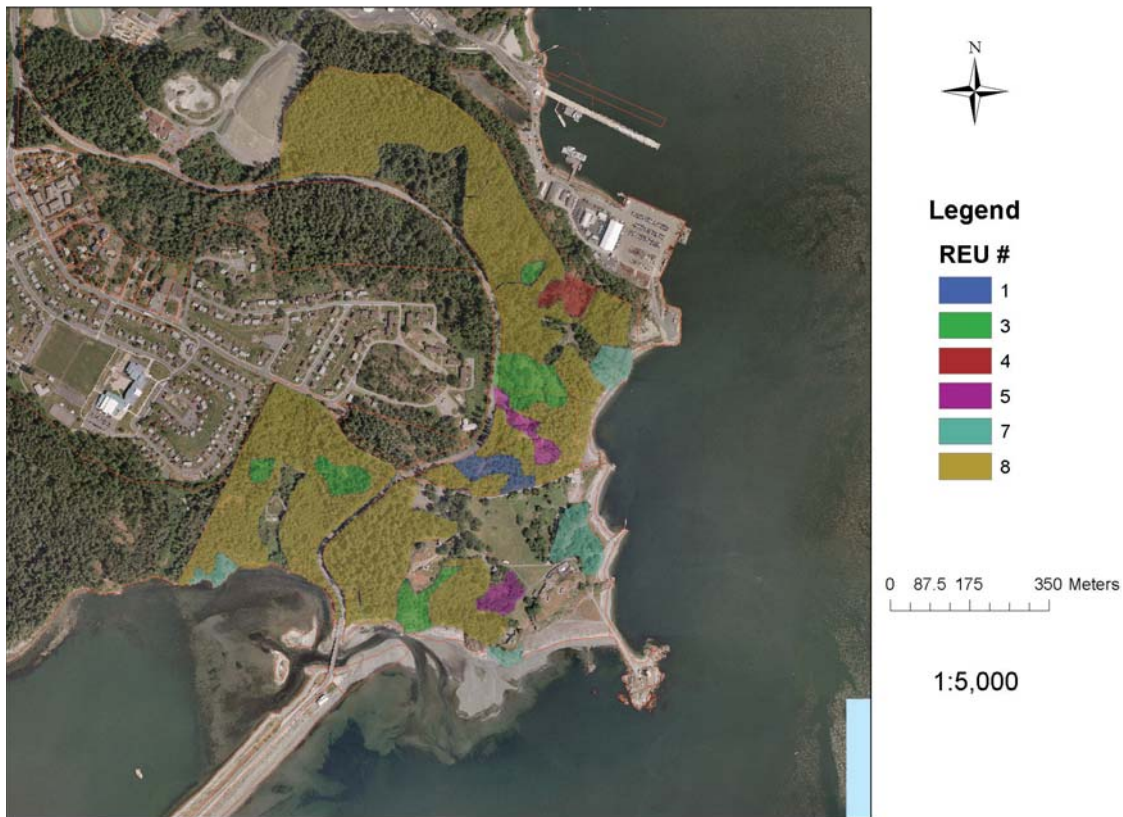
Figure 7.1 A preliminary attempt, for illustration purposes, at applying the Restoration Ecosystem Units (REU) classification system to the vegetation of Fort Rodd Hill National Historic Site of Canada.

(REU) system proposed in Chapter 2 is recommended. The REU classification is ecologically sound because it is based upon previous studies of Garry Oak ecosystems by qualified ecologists (Erickson and Meidinger 2007). As well, the REU classification system is compatible with the two other ecological classification systems that are widely used in British Columbia—the biogeoclimatic system (Meidinger and Pojar 1991) and the ecoregional system (Demarchi 1995). REUs are of special importance to restoration practitioners because they also function as treatment units, i.e., all polygons of a particular type of REU should respond similarly to a restoration treatment.