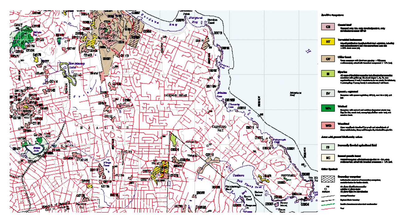
Figure 3.2. Example of the information available on an SEI map.

• The <u>Sensitive Ecosystem Inventory (SEI)</u><sup>45</sup> is a tool that can be used to help identify the actual geographic location of some GOEs. The SEI identifies remnants of rare and fragile terrestrial ecosystems for the purposes of encouraging land-use decisions that will ensure the continued integrity of these ecosystems. One of the products is a series of maps showing sensitive ecosystems including "woodland", which include stands of Garry oak and mixed stands of Garry oak/Arbutus, Garry oak/Douglas-fir, and Arbutus/Douglas-fir. These maps can be obtained from Clover Point Graphics in Victoria. An example of these maps is provided in Figure 3.2.